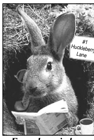
Every bunnie loves Huckleberry Press!

509-724-8086 PacificNorthwestshepherds.com