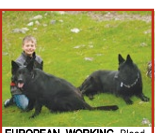
EUROPEAN WORKING Bloodline German Shepherd Dogs Championship, World Class Genetics. A.K.C. O.F.A. Pups available, $1500-$1000 Discounts for Veterans, disabled, senior.

509-724-8086 PacificNorthwestshepherds.com